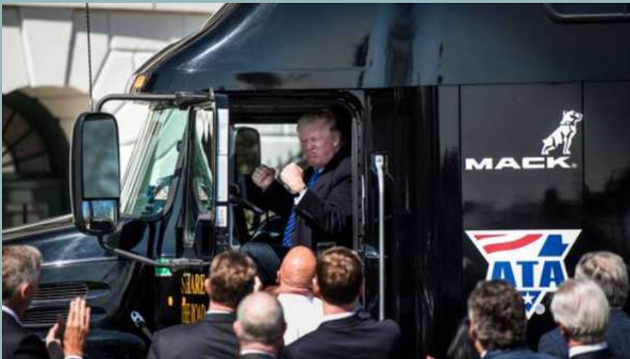
President Donald Trump poses for a photo during his first Administration

Elections have consequences. Regardless of one's personal political preferences, this maxim always holds true and its impact to truck safety is no exception.