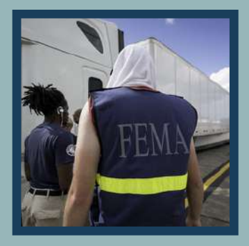
FCMSA Cuts Back on Unnecessary CMV Exemptions During Emergencies