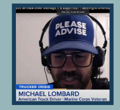
<u>NewsNation: Why was there</u> <u>emphasis on truck driver</u> <u>shortage, if it wasn't real?</u>