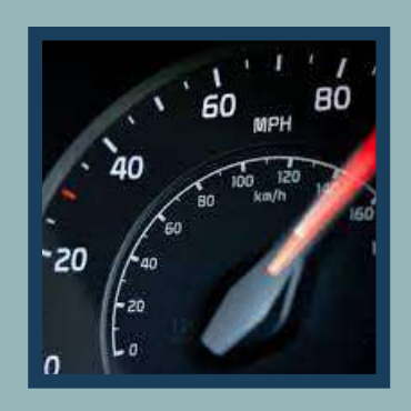
StreetsBlog: DRIVE Act Aims to Prohibit CMV Speed Limiters