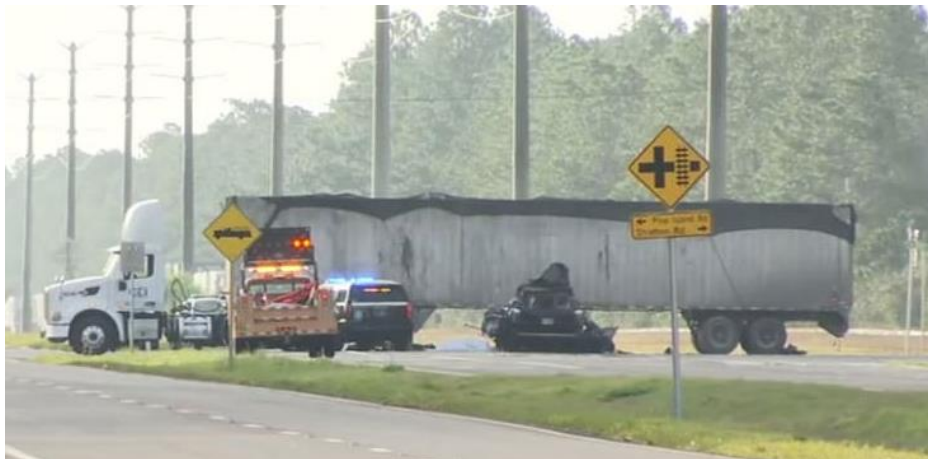
Figure 1: On Feb. 21, a passenger vehicle passed under a CMV that was not equipped w/side underride guards, killing the driver.