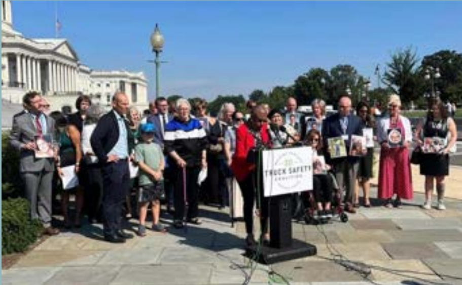
Congresswoman Eleanor Holmes Norton (D-DC) opened TSC's crash victim and survivor press conference at Sorrow to Strength

Sorrow to Strength was a remarkable experience! We were joined by friends new and old and were able to support one another and agitate for truck safety reforms. Over the course of the 4-days we heard from powerful and passionate safety leaders and somehow managed to have 80 meetings with federal departments and agencies, members of congress and congressional committees!!!