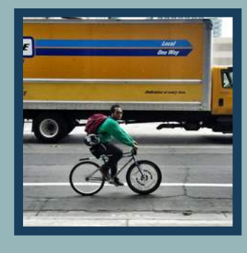
StreetsBlog: Will NHTSA Require New Tech (AEB)?