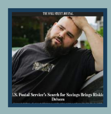
<u>USPS Reliance on Broker</u> <u>Contracting Threatening Safety</u>