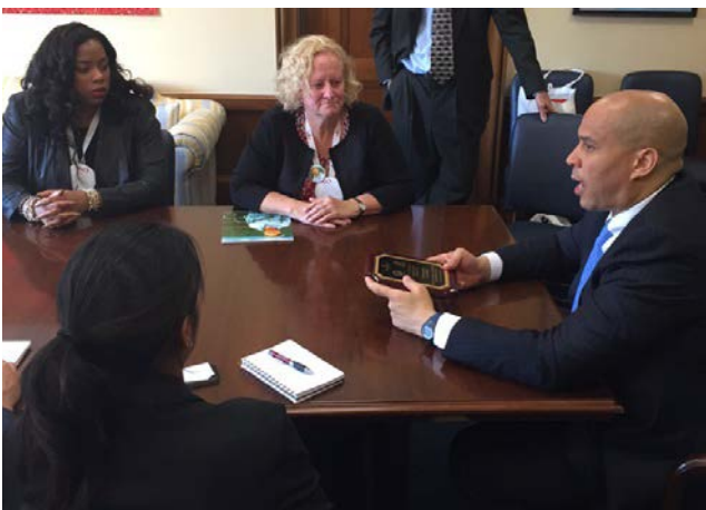
Morgan Lake, Dawn King, Senator Corey Booker (D-NJ)